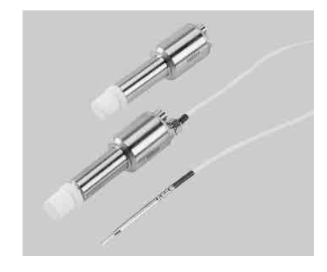
HPP271 & HPP272 probe