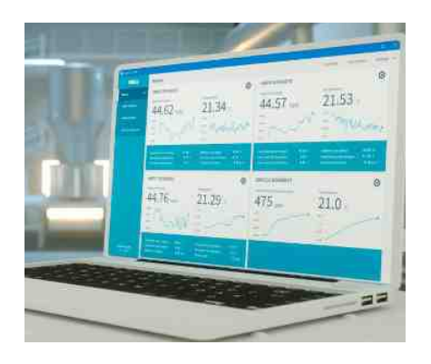
Vaisala Insight PC Software

The software, which features an intuitive graphical user interface, also allows probe field calibration and adjustments. It also enables easy testing and evaluation – the 48-hour data logging functionality allows data to be recorded from up to six devices simultaneously, with easy export to an Excel-readable format.