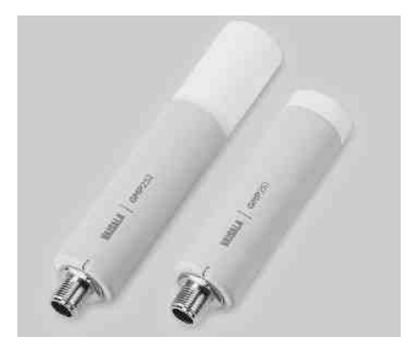
GMP251 & GMP252 probe