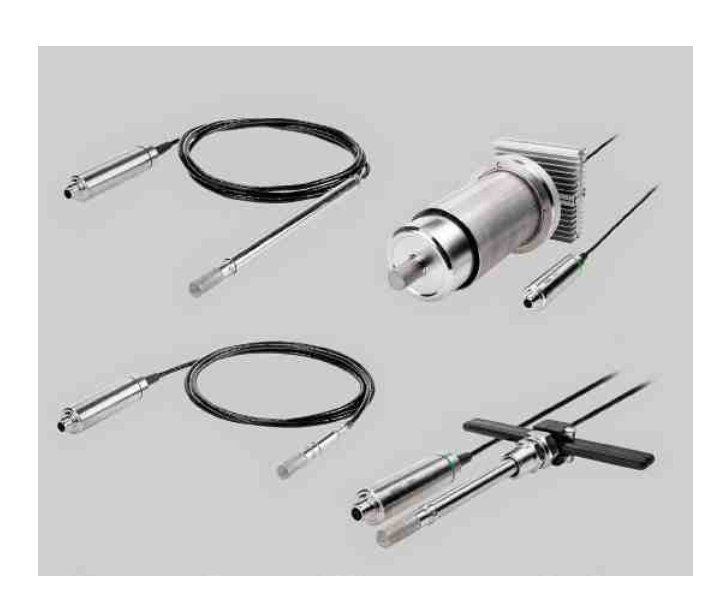
Indigo compatible dew point probes.