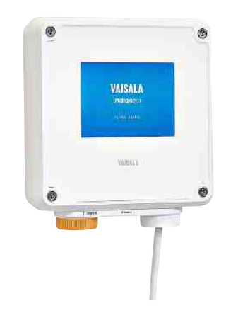
Vaisala Indigo 200 Series Transmitter