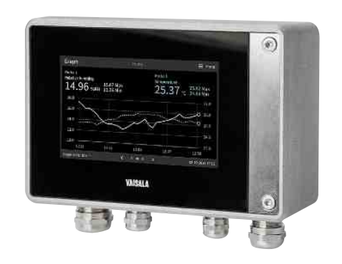
Vaisala Indigo 500 Series Transmitter